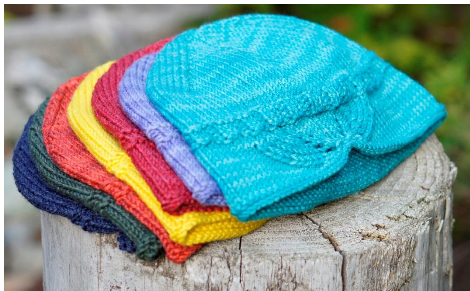
Colors shown (L to R): Sueño Worsted #1335, #1345, #1324, and #1399; and Sueño Worsted Tonal #1525, #1551, and #1547.

To save time, check your gauge and read all instructions thoroughly before beginning.